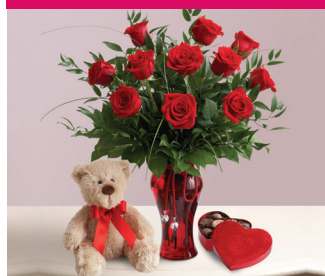
1-800-FLOWERS® Abundant Love™ Bundle