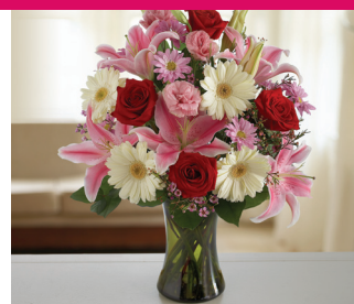
1-800-FLOWERS® Elegant Wishes™