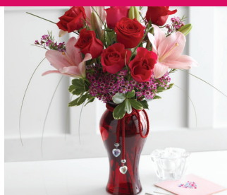
1-800-FLOWERS® Dazzle Her Day™