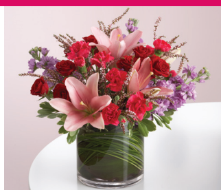
1-800-FLOWERS® Be Mine™ "VALENTINE" Bouquet